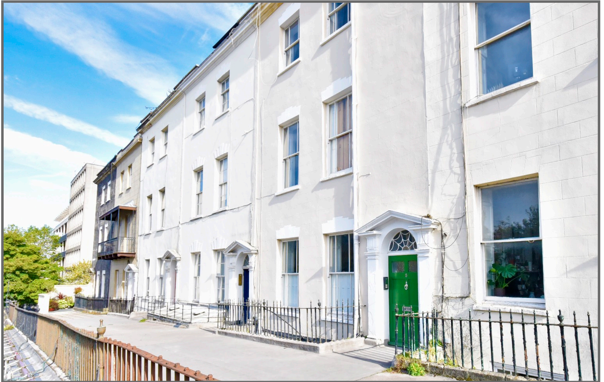
FLAT 1, 4 RICHMOND TERRACE, CLIFTON, BS8 1AB